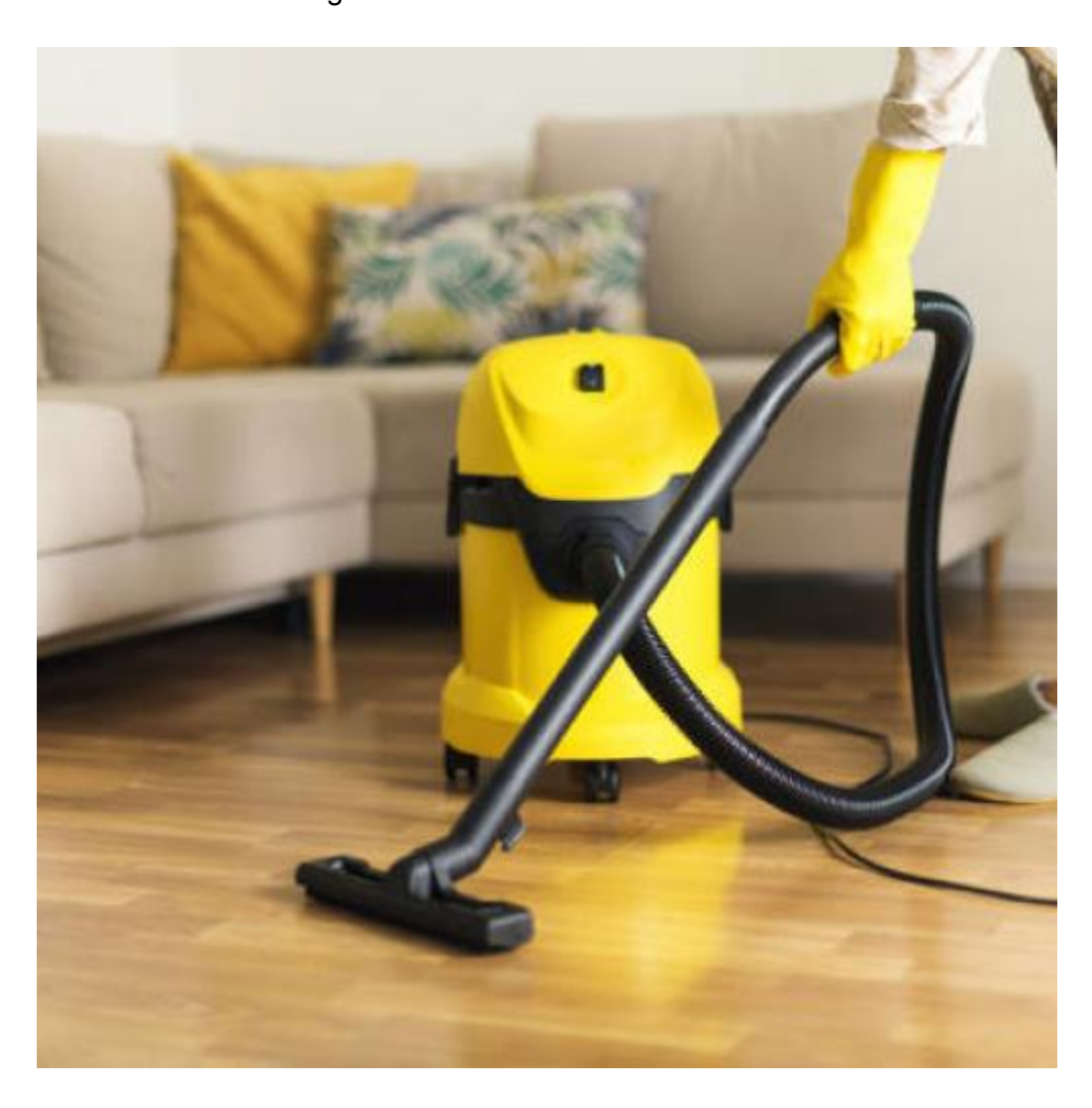
A Cleaning Service That Cares for Your Wellness

A clean room is greater than simply aesthetically appealing; it plays a crucial role in keeping wellness and wellness. CJM Cleaning Business is committed to giving remarkable cleaning services with the assisting concept "Tidy with Pleasure, Maintain with Treatment." We take satisfaction in guaranteeing that our cleaning approaches and devices meet the highest possible standards. With our Asthma & Allergy Friendly certification, we assure that our chosen cleaning gadgets are secure for individuals with allergic reactions or asthma, promoting a much healthier interior setting.